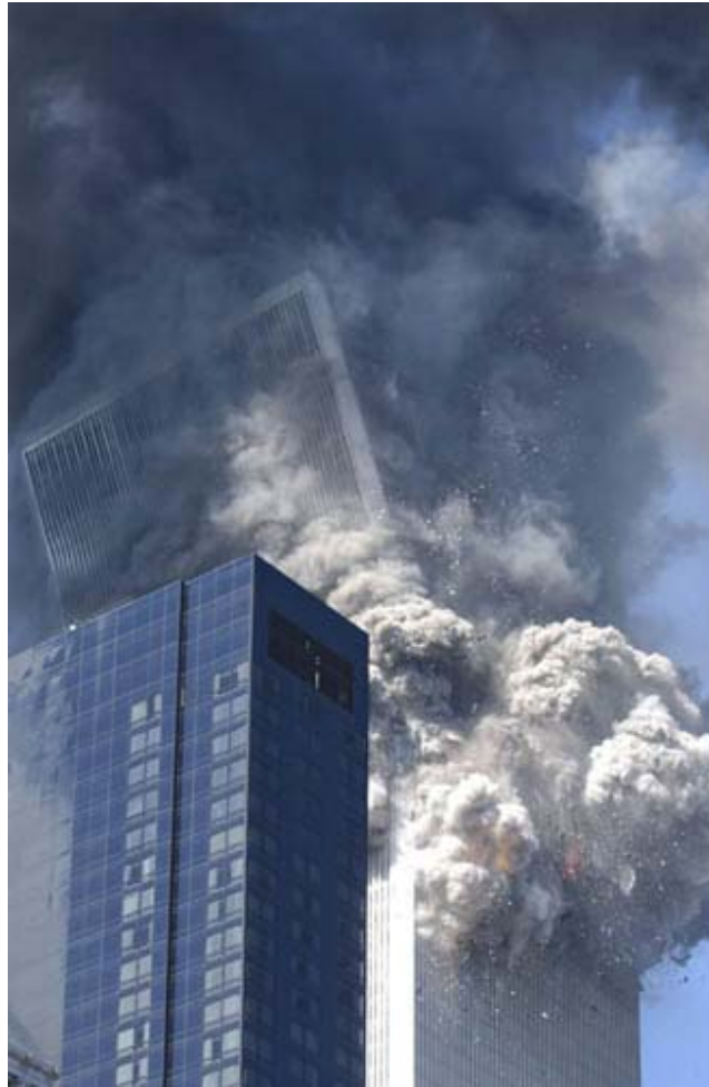
Figure 3. (On next page)

When the tower collapses there are 2 independent clouds of smoke and debris that appear in rapid succession to each other. The photos on the right have markings on them. The red circle indicates the first cloud the yellow one the second cloud. This is prima facie evidence of the presence of demolition explosives. The two clouds indicating 2 places where the explosives were installed. Consistent with an implosion.